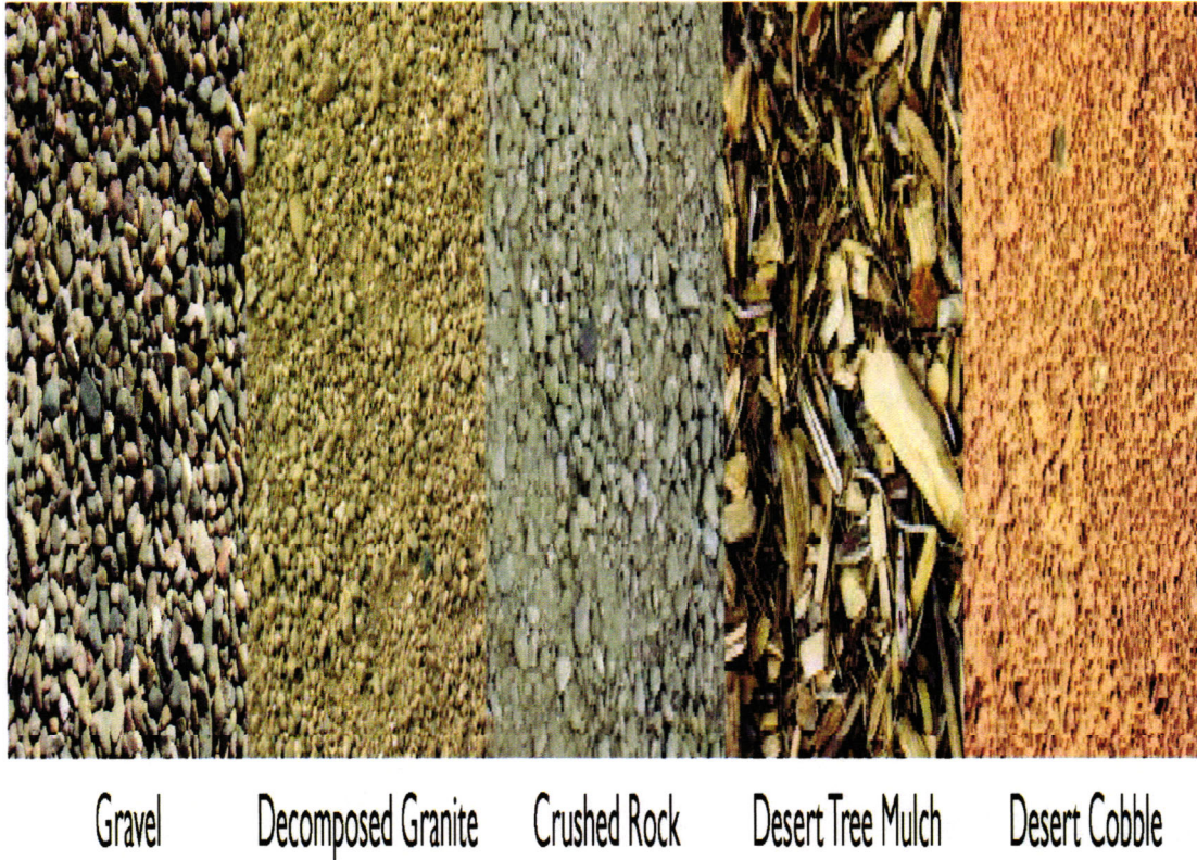
Figure 18.90.030.D. Ground Cover Types

E. Irrigation Systems. Required irrigation systems shall be underground automatic watering systems, unless the lot is served by functioning flood irrigation. Irrigation and plantings within three feet of public utilities, such as but not limited to electrical transformers, light poles and fixtures, and communication services, shall be limited to drip systems so as to not overspray to cause undue corrosion to utility structures.